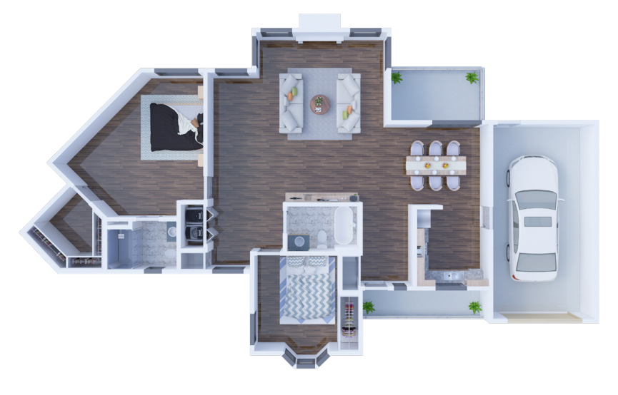
CC3 Cottage 1,468 SQ FT