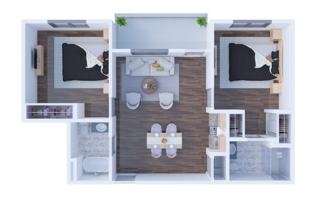
C5 Two Bedroom 893 SQ FT