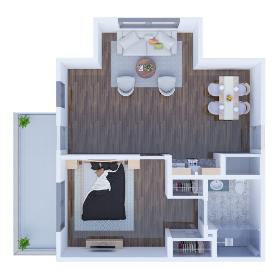
B8 One Bedroom 665 SQ FT