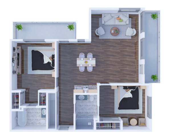
C1 Two Bedroom 1,056 SQ FT