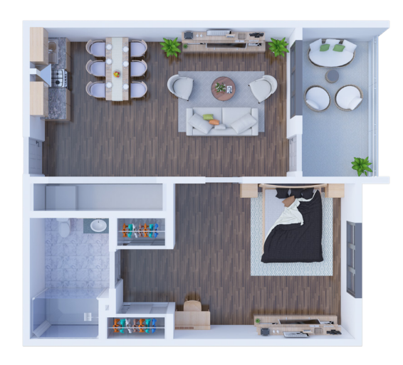
B1 One Bedroom 549 SQ FT