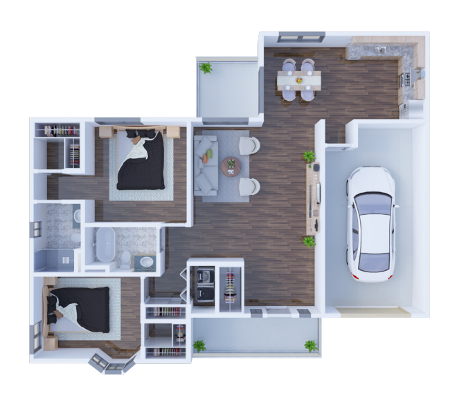
CC2 Cottage 1,289 SQ FT