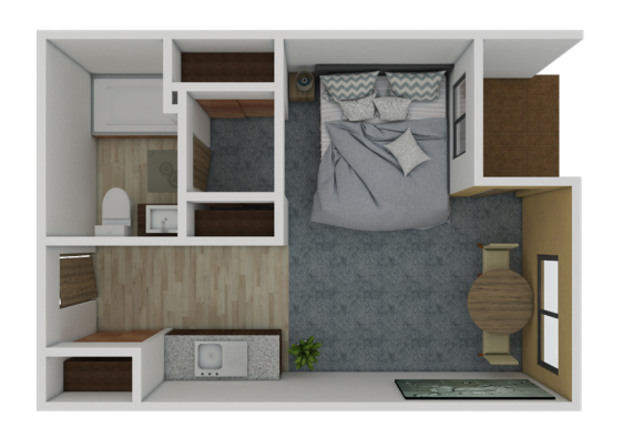
Al Studio 404 SQ FT

Solstice Senior Living at Corpus Christi offers several floor plan choices to suit your needs.